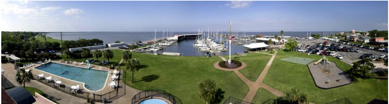
View from Clubhouse of HYC grounds, harbor, a portion of parking area, and Galveston Bay.