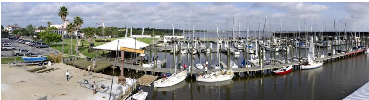
View of one permanent hoist, outdoor Beachcomber cabana, and the main dedicated rigging dock.