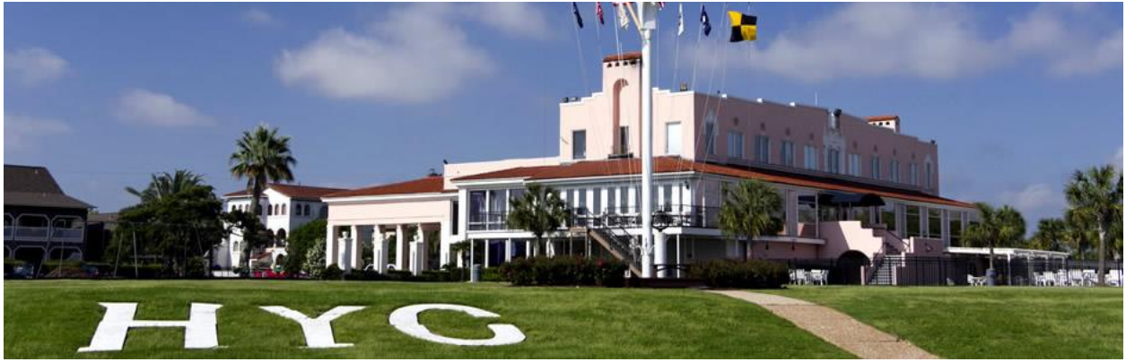
View of HYC Clubhouse and spacious lawn. Clubhouse contains bar, restaurant, ballroom and other dedicated rooms.