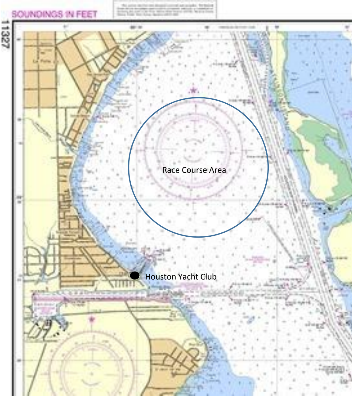
Chart of Race Course and Location of Houston Yacht Club