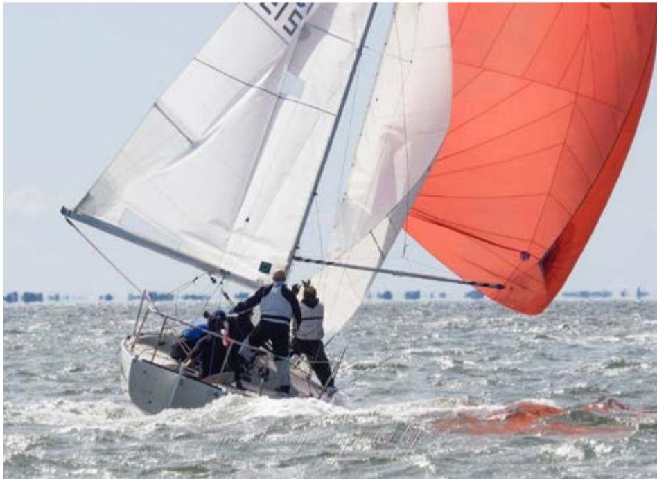
Image from Sayville, NY host of the 2021 J/24 North Americans