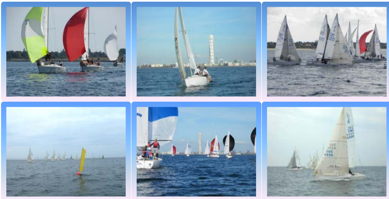
Photo credit: Fredric Johanson, Lagunen, Pictures from J/24 Swedish Open 2012, Lagunen Malmoe