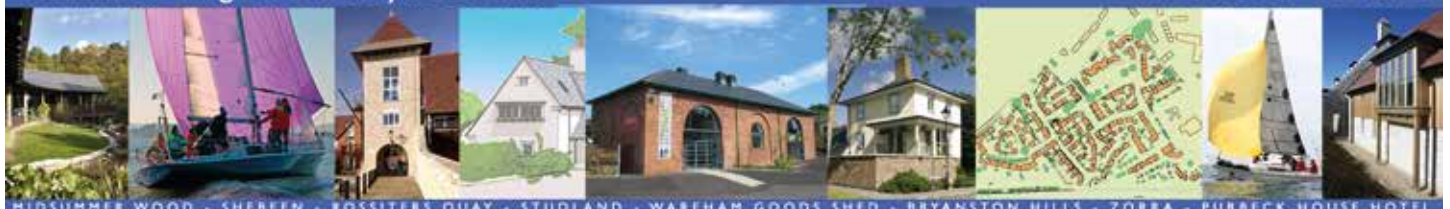
HIDSUMMER WOOD · SHEBEEN · KOSSITERS QUAY · STUDLAND · WAREHAM GOODS SHED · BRYANSTON HILLS · ZORRA · PURBECK HOUSE HOTEL